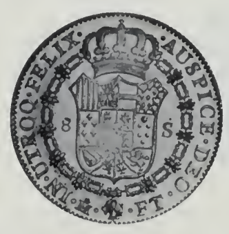
Lot No. 2377

8 Escudos, 1801, 1 over 0, Mo-FT. 3rd Type of Charles IV. Obv. His own armored and peruked bust. Rv. As before. C-T 51, Fr.43. A full cameo prooflike early striking and, except possibly for the very center of the reverse, a firm and even impression. The surfaces are free of any serious marks or flaws and, considering the minting techniques of the time, it is hard to imagine a more lovely example of the type. About Uncirculated. (2,500-3,000)